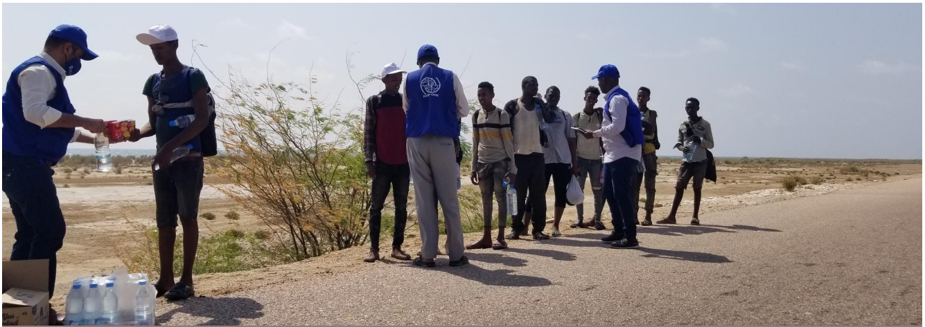
Food distribution provided by IOM in Shabwah Governorate.