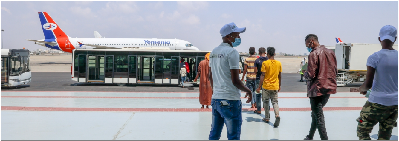
Migrants depart from Aden airport through IOM's voluntary humanitarian return programme