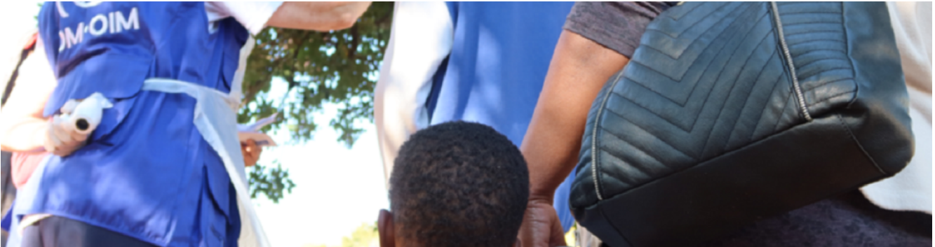
IOM staff supporting Port of health in the COVID-19 response screening migrant returnees at Beitbridge POE