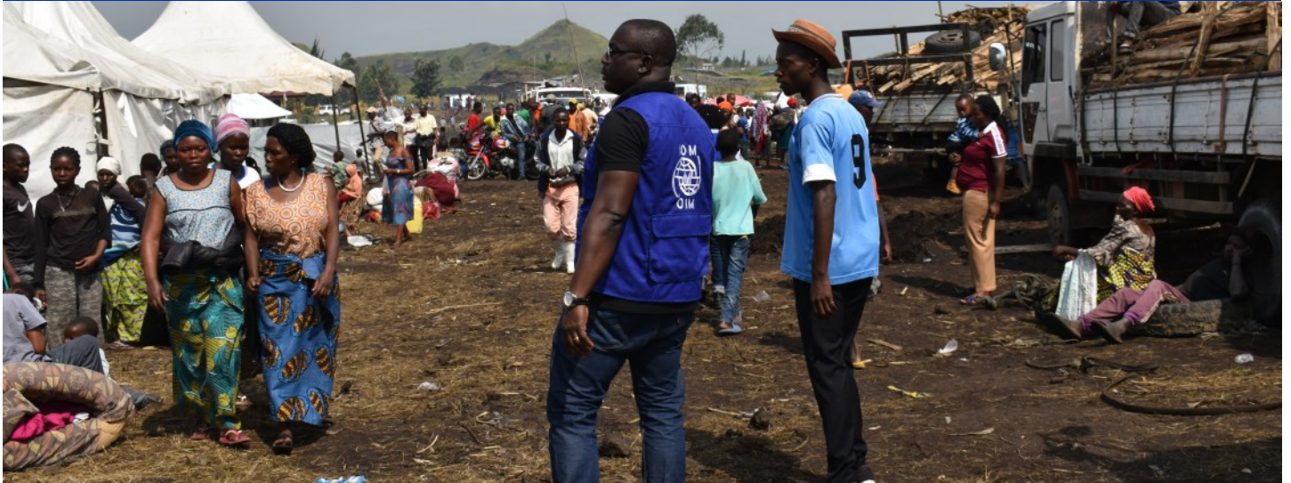
Needs assessment at the Lac Vert/Bulengo informal site currently hosting thousands of conflict-affected persons.