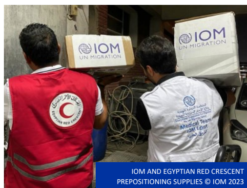
IOM AND EGYPTIAN RED CRESCENT PREPOSITIONING SUPPLIES