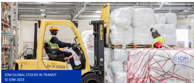
IOM GLOBAL STOCKS IN TRANSIT