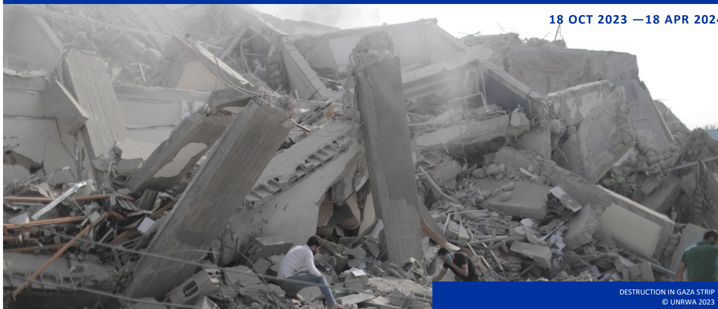
DESTRUCTION IN GAZA STRIP