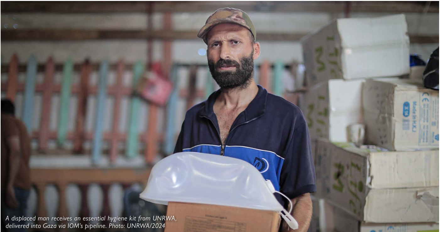
A displaced man receives an essential hygiene kit from UNRWA, delivered into Gaza via IOM's pipeline.

Strikes by the Israeli Defense Forces (IDF) continue, with aerial, land and maritime bombardment across the Gaza Strip resulting in civilian casualties, mass displacement and the destruction of homes and infrastructure. Since October 2023, nine out of ten people in Gaza have been internally displaced, with some experiencing displacement up to 10 times. Safety, along with access to appropriate shelter, health care, and water and sanitation facilities, is a priority concern for the displaced population.