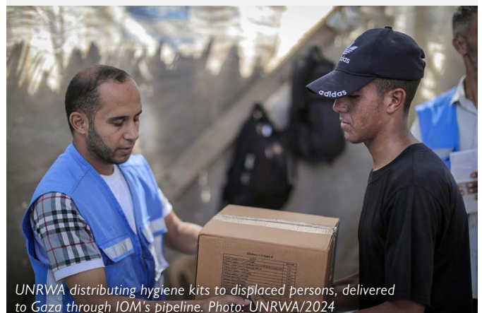
UNRWA distributing hygiene kits to displaced persons, delivered to Gaza through IOM's pipeline.