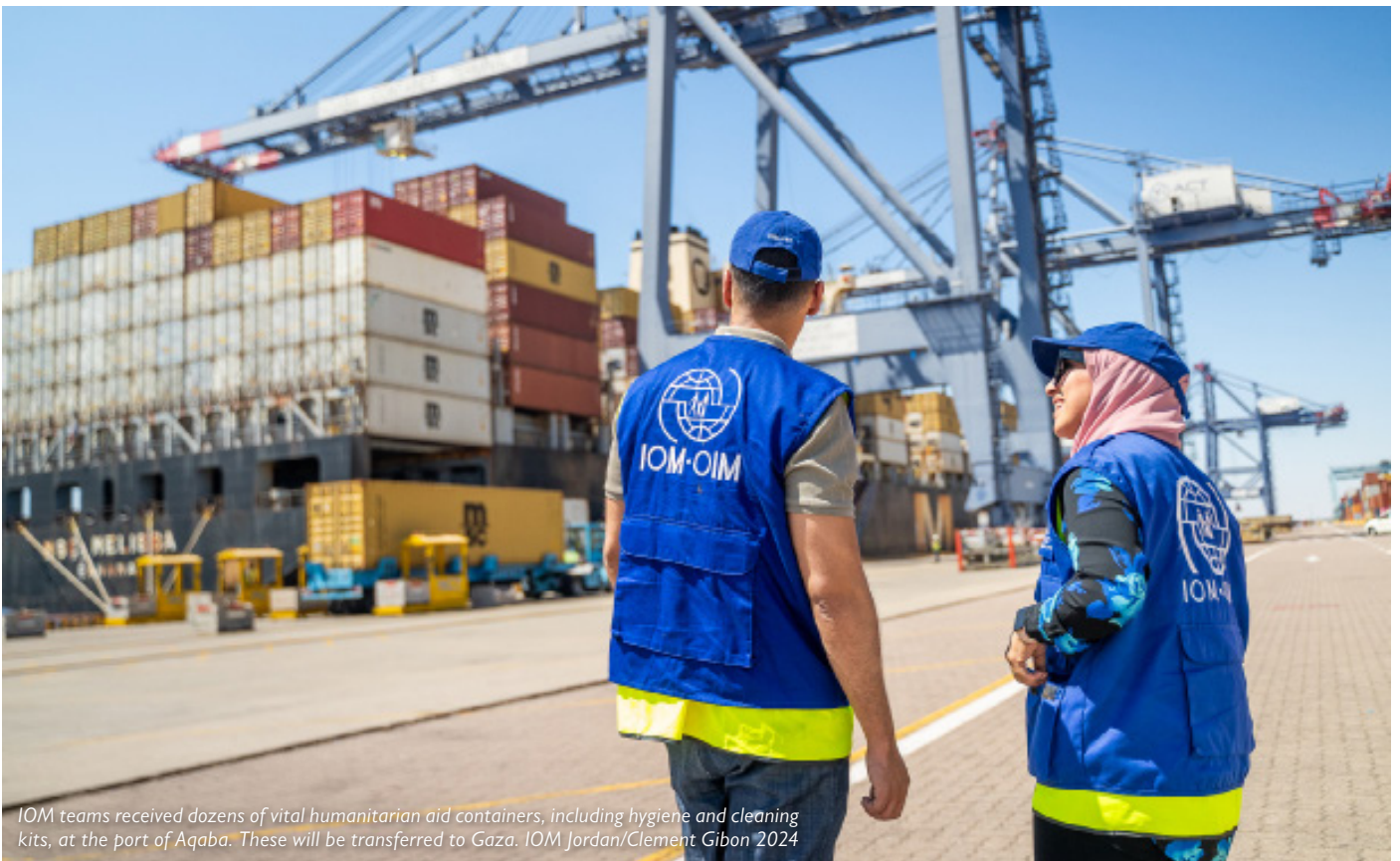
IOM teams received dozens of vital humanitarian aid containers, including hygiene and cleaning kits, at the port of Aqaba. These will be transferred to Gaza.

5.46M items under procurement as of 2 October 2024