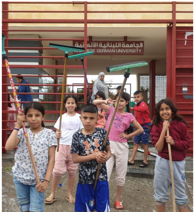
Children from displaced families in south Lebanon at the German Lebanese University

Moreover, due to the closure of the border, no trucks have been able to cross the border into Gaza via Rafah and Kharem Shalom during the reporting period. The total number stands at 205 trucks that have entered Gaza since October 2023, out of the 246 that were sent transporting donated items by NRC and Oxfam.