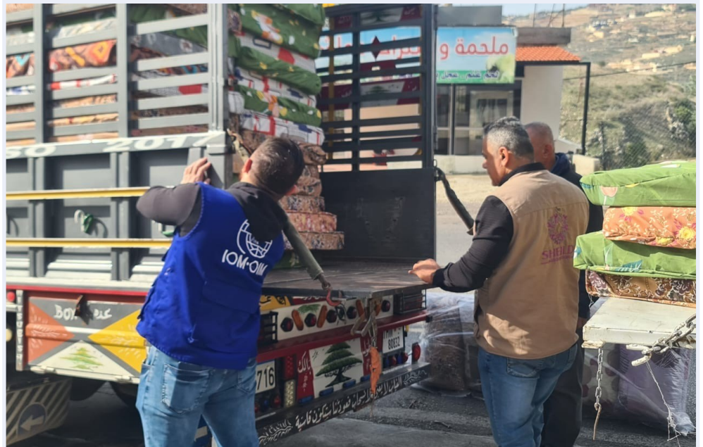
IOM and SHEILD delivery of mattresses and bed items in Southern Lebanon