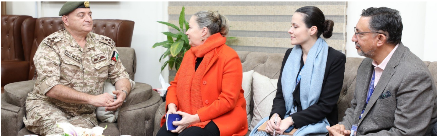
IOM meeting with the Director of Royal Medical Services (RMS), within the Jordanian Armed Forces

Between 02 November and 14 December, IOM Egypt supported a total of 685 Third Country Nationals (TCNs), family members, and evacuees with various types of assistance including accommodation, land transport, air transport, protection assistance, and/or medical assistance (referrals, fit-to travel checks, medical referrals, etc.) at the request of their respective Embassies.