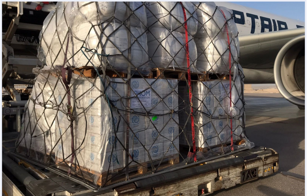
IOM relief items ready for shipment from Nairobi to Al Arish