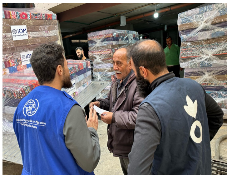
Core relief items delivered to Action Contre la Faim (ACF)'s warehouse in Tyre, Southern Lebanon

Between 02 November and 28 December, IOM Egypt supported a total of 714 Third Country Nationals (TCNs), family members, and evacuees with various types of assistance including accommodation, land transport, air transport, protection assistance, and/or medical assistance (referrals, fit-to travel checks, medical referrals, etc.) at the request of their respective Embassies.