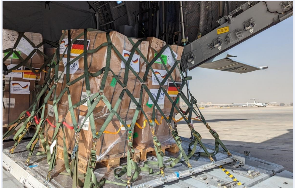
NRC relief items donated by the German Federal Foreign Office delivered to Al Arish and transported into Gaza by IOM