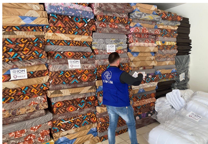
IOM and SHEILD distribution in Southern Lebanon

Between 02 November and 11 January, IOM Egypt supported a total of 716 Third Country Nationals (TCNs), family members, and evacuees with various types of assistance including accommodation, land transport, air transport, protection assistance, and/or medical assistance (referrals, fit-to travel checks, medical referrals, etc.) at the request of their respective Embassies.