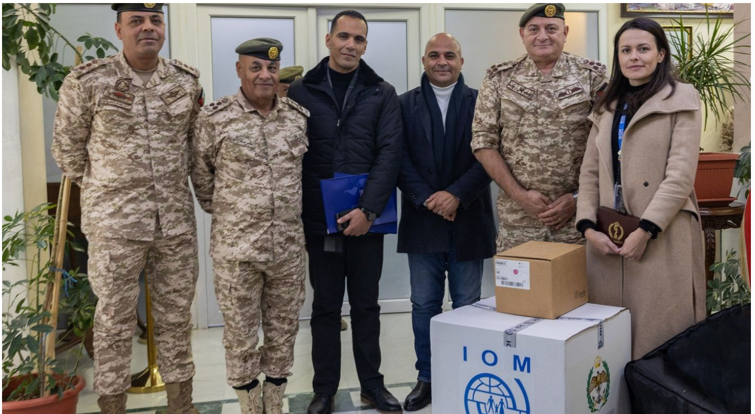
IOM Jordan meeting with Director of RMS for the delivery of medical and surgical supplies

Since November 2023, IOM Egypt supported 721 Third Country Nations (TCNs), family members, and evacuees with various types of assistance including accommodation, land transport, air transport, protection assistance, and/or medical assistance (including medical referrals and fit-to-travel checks) at the request of their respective Embassies.