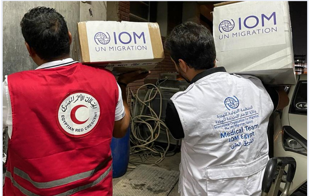
IOM delivering medical items to the Egyptian Red Crescent (ERC)