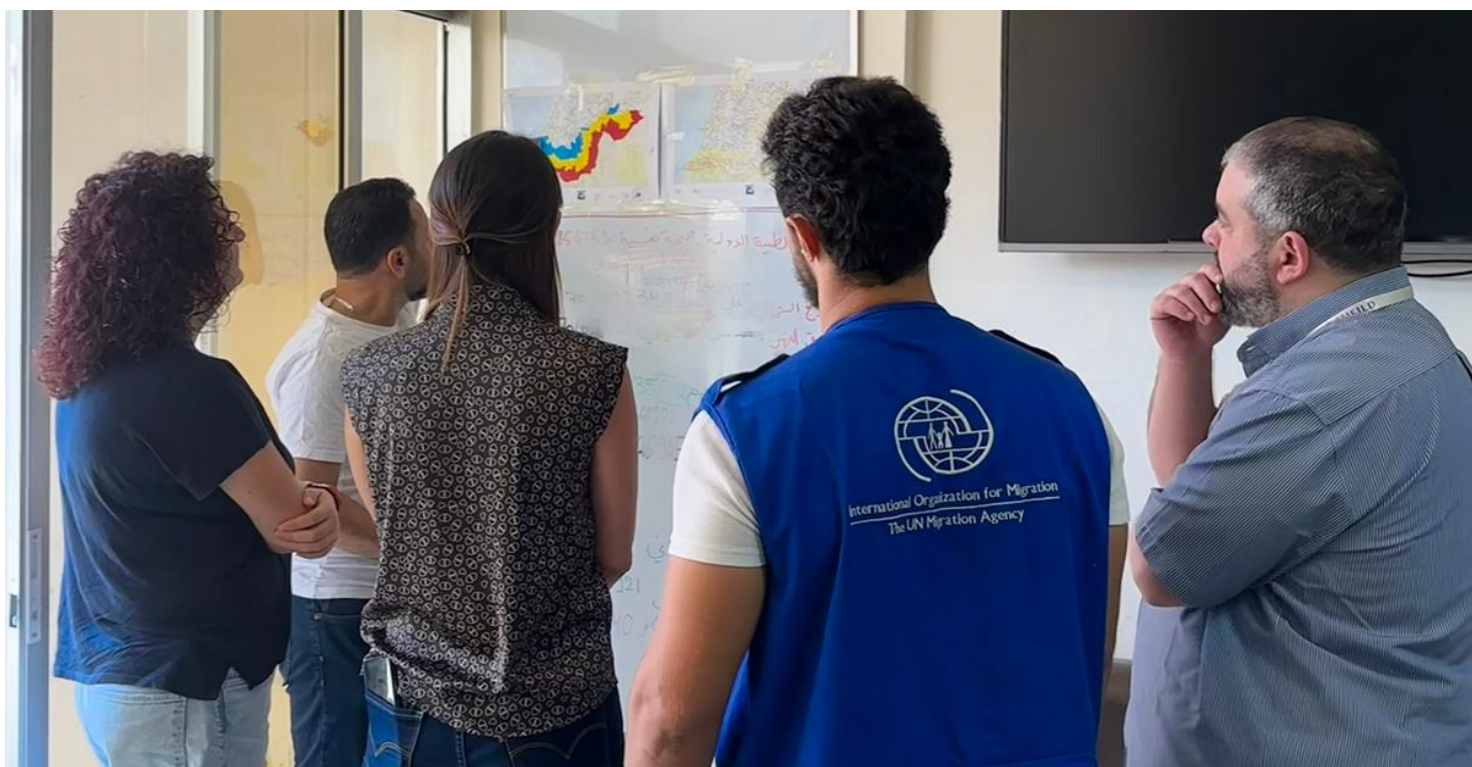
IOM, the Disaster Risk Reduction Unit of the Union of Municipalities, and SHEILD in Tyre, Southern Lebanon working on local preparedness mechanisms

In Egypt, IOM has handed over 8,005 non-food items and 3,000 tarps to the Egyptian Red Crescent (ERC) for onward distribution to UNRWA and the Palestinian Red Crescent. An additional 1,750 units of medicine have been added to the pipeline for distribution. IOM continues to liaise and coordinate daily with UN partners and ERC the planned response, procurement and logistical arrangements and the potential scale up of the response as the number of trucks allowed through the border may increase. On Tuesday the 24 October, IOM Egypt gathered 25 representatives from 14 countries to present IOM's response capacity in supporting the movement of Third Country Nationals from Gaza into Egypt for onwards transportation to their respective country of origin.