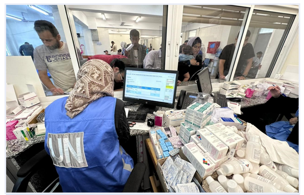
UNRWA Gaza Emergency Health Centre Khan Younis