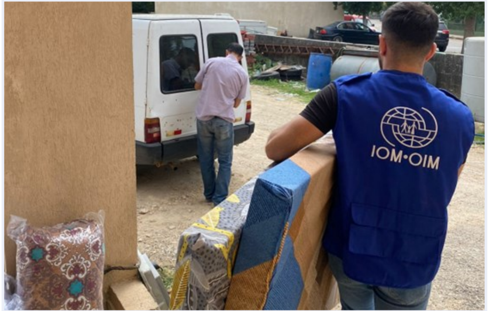
IOM and SHEILD delivering NFI items to IDPs in Southern Lebanon