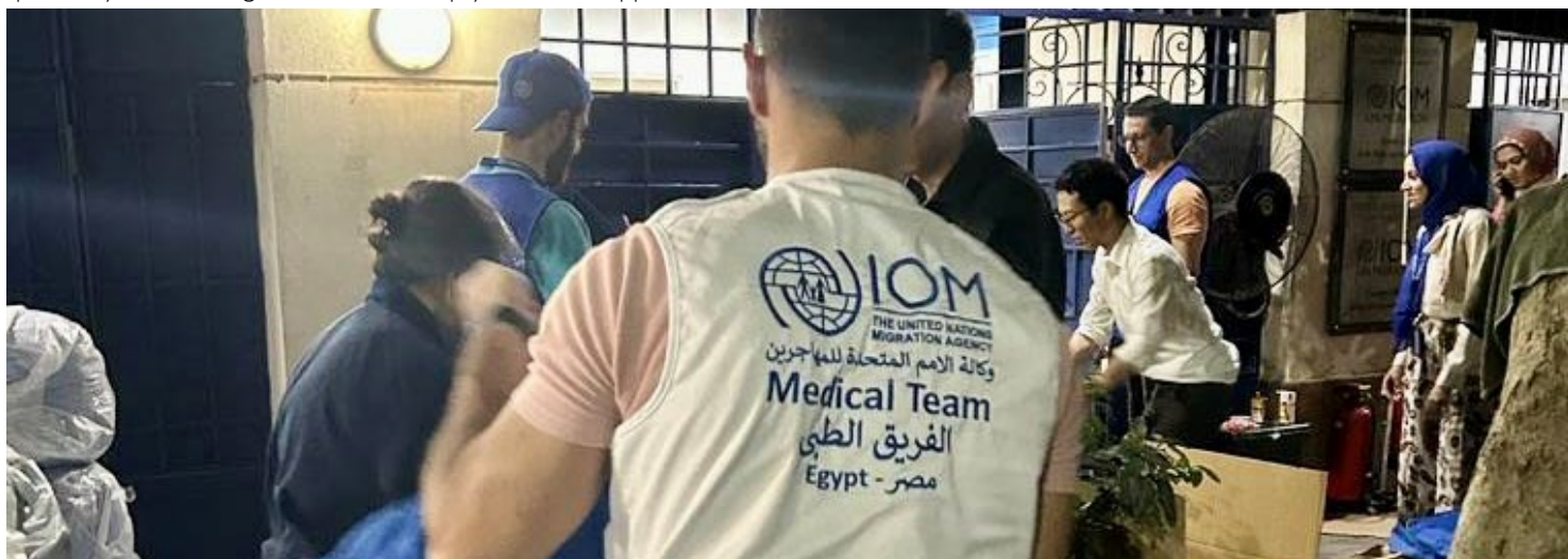
Preparations for the donation of medical items and medicines

IOM Egypt also continues to coordinate with OCHA via the Inter-Agency Humanitarian Coordination structure on capacity building, training and other support that can be provided to ERC.