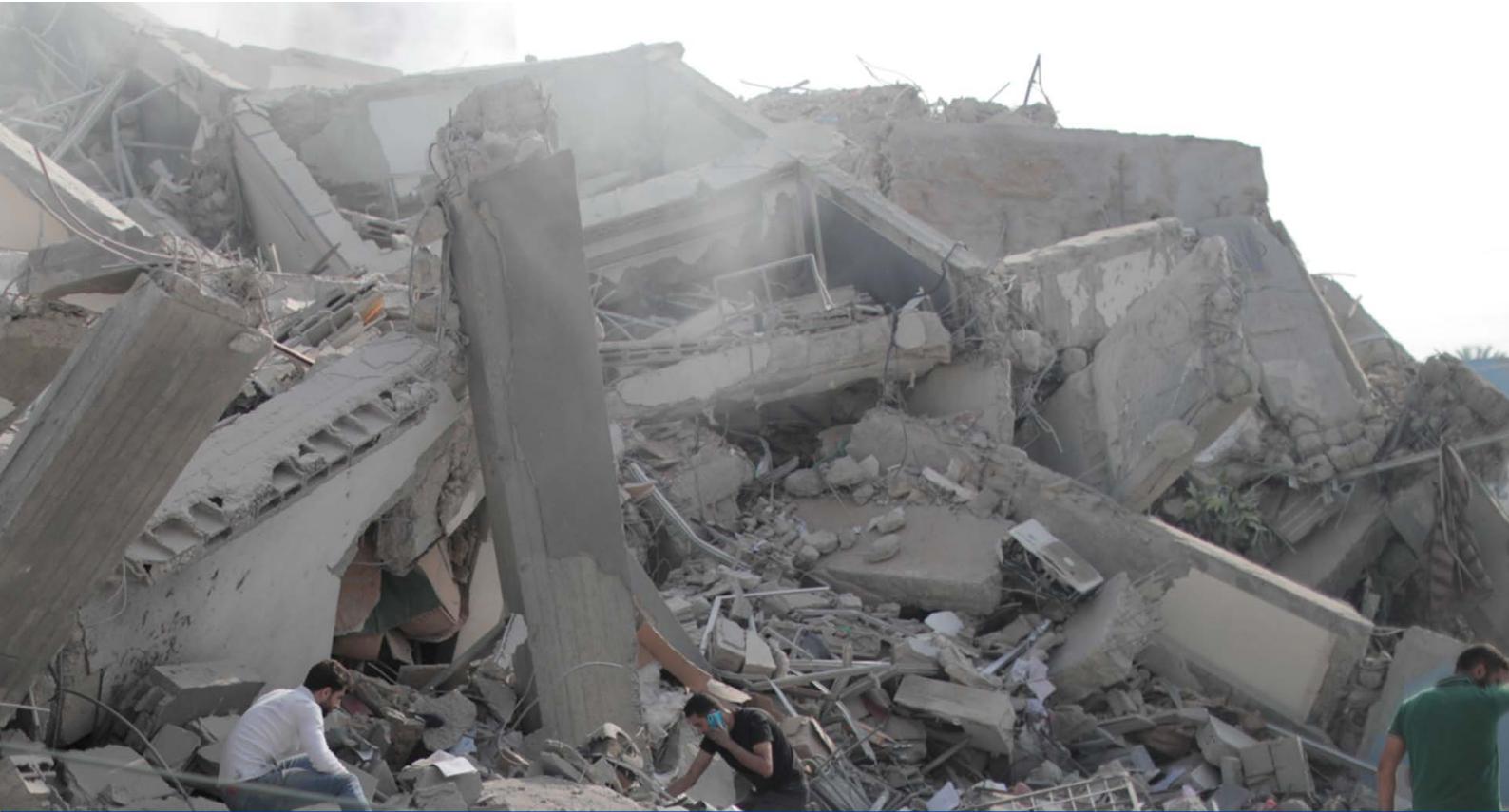
Destruction in Gaza Strip