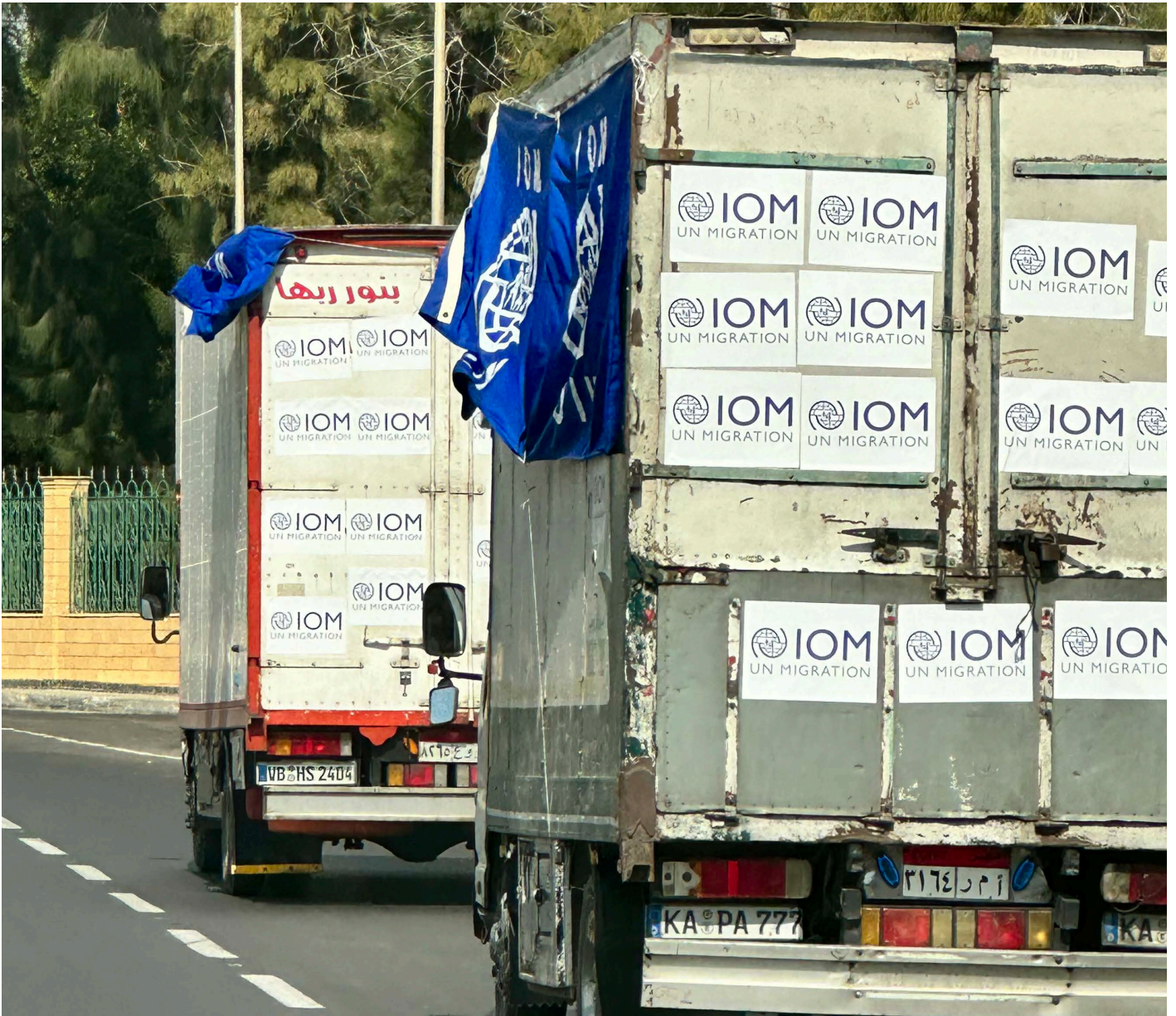
IOM trucks in Egypt with hygiene kits, medical items, mattresses and other non-food items for donation to the Egyptian Red Crescent.